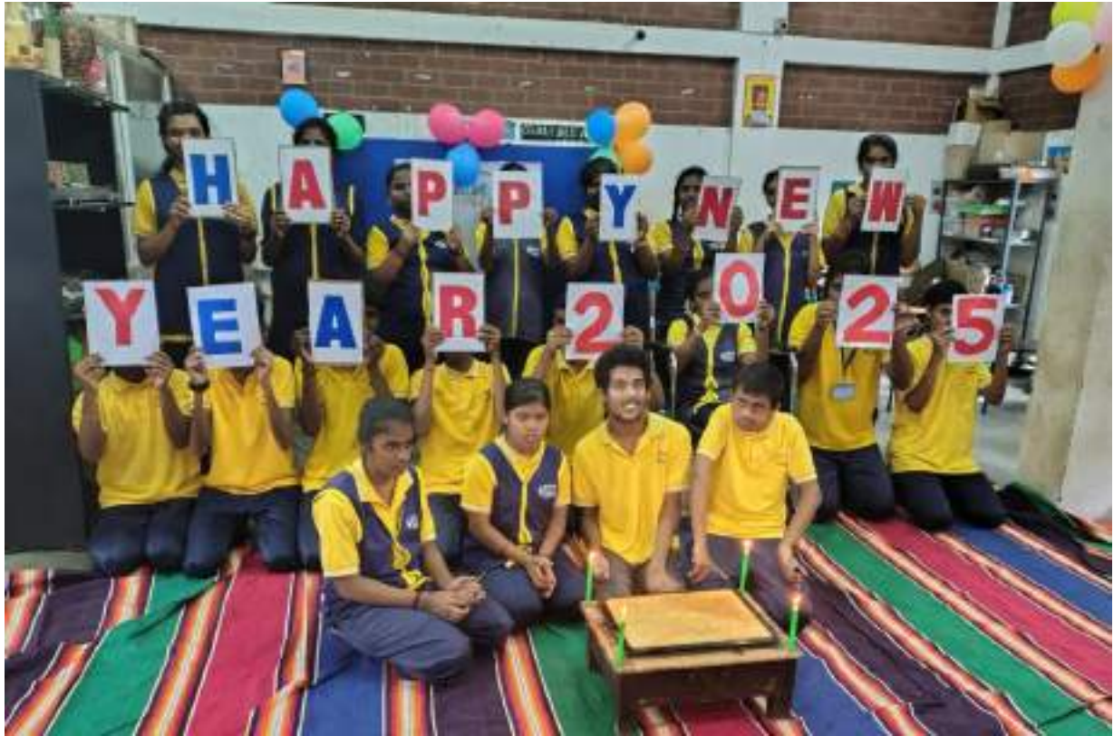
In pic: Students of Satya Special School spreading joy as they welcome 2025 with colorful celebrations

Ignite a Dream; shape a Brighter Tomorrow!